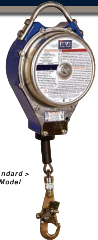
Standard > Model